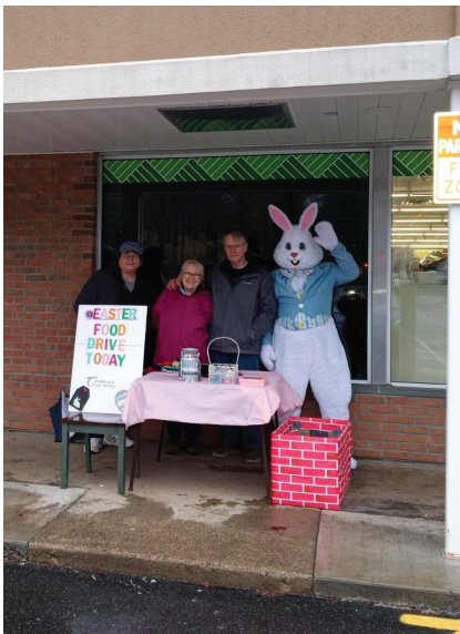
EASTER FOOD DRIVE