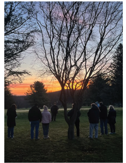
EASTER SUNRISE SERVICE